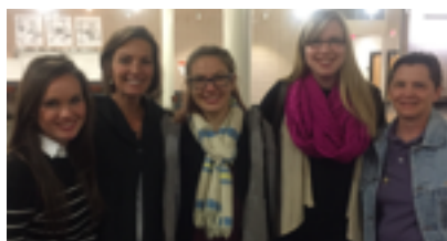
Team building at the Hope for Freedom event hosted by Beza Threads at Valley High School.

Finally, to have a few minutes to enjoy the beautiful fall weather has been a true gift! I am very blessed to have been given this task and to be surrounded by so many who prop me up along the way and who help remind me that none of it is up to me anyway.